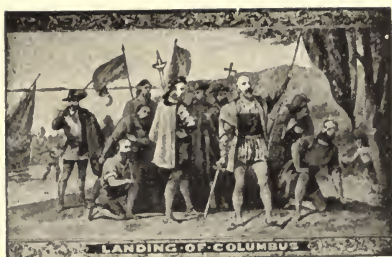
LANDING OF COLUMBUS